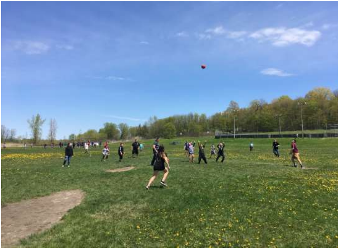
Great game! Lots of fun had by all (AMS Students & AMPS members pictured below)