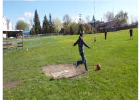
Kickball game in Kana:takon