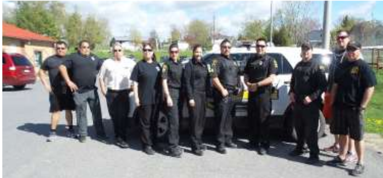
AMPS members participating in a game of Kickball with kids from Kana:takon and Kawehno:ke